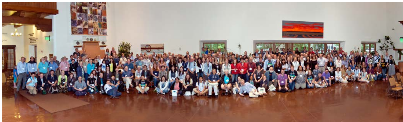
Group photo at the 80 th Annual Meeting in Santa Fe.